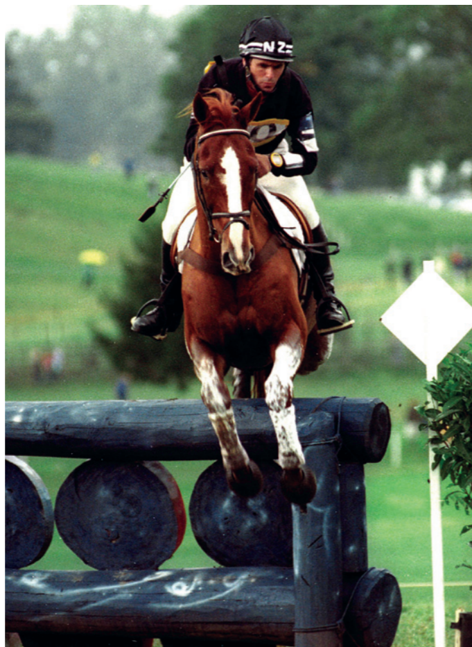
Kiwi legends: Blyth Tait (above), and Mark Todd (below).